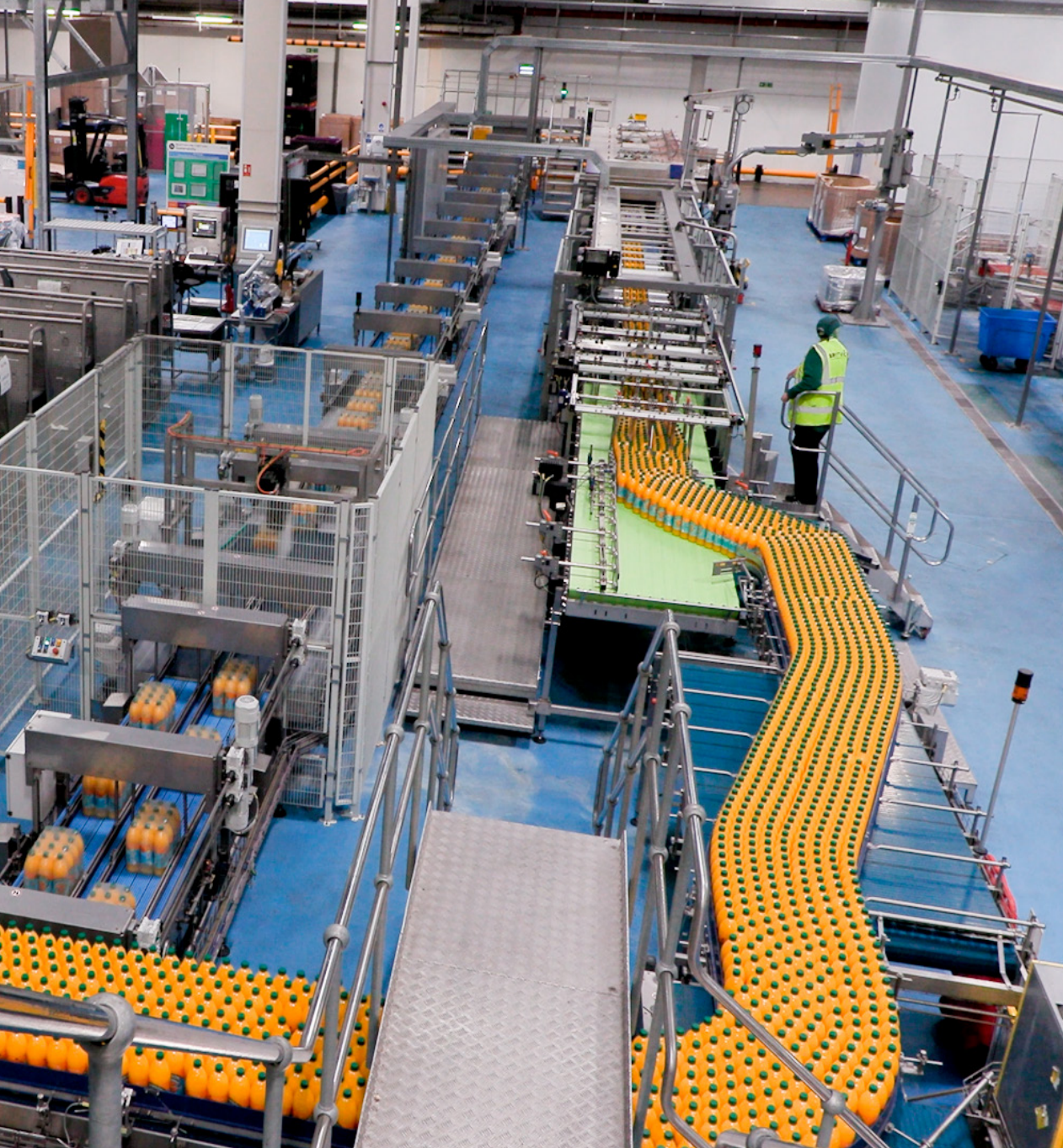
Carlsberg Britvic produces 14 million cases of carbonated and still beverages a year – including brands like Pepsi, 7UP and UK-household brand Robinsons.