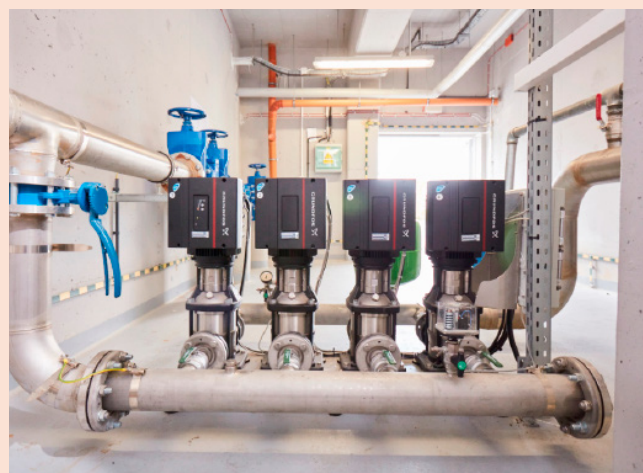
The Hydro Multi-E Booster set ensures pressure in the water supply throughout the huge arena – also when it is filled with 22,000 guests.