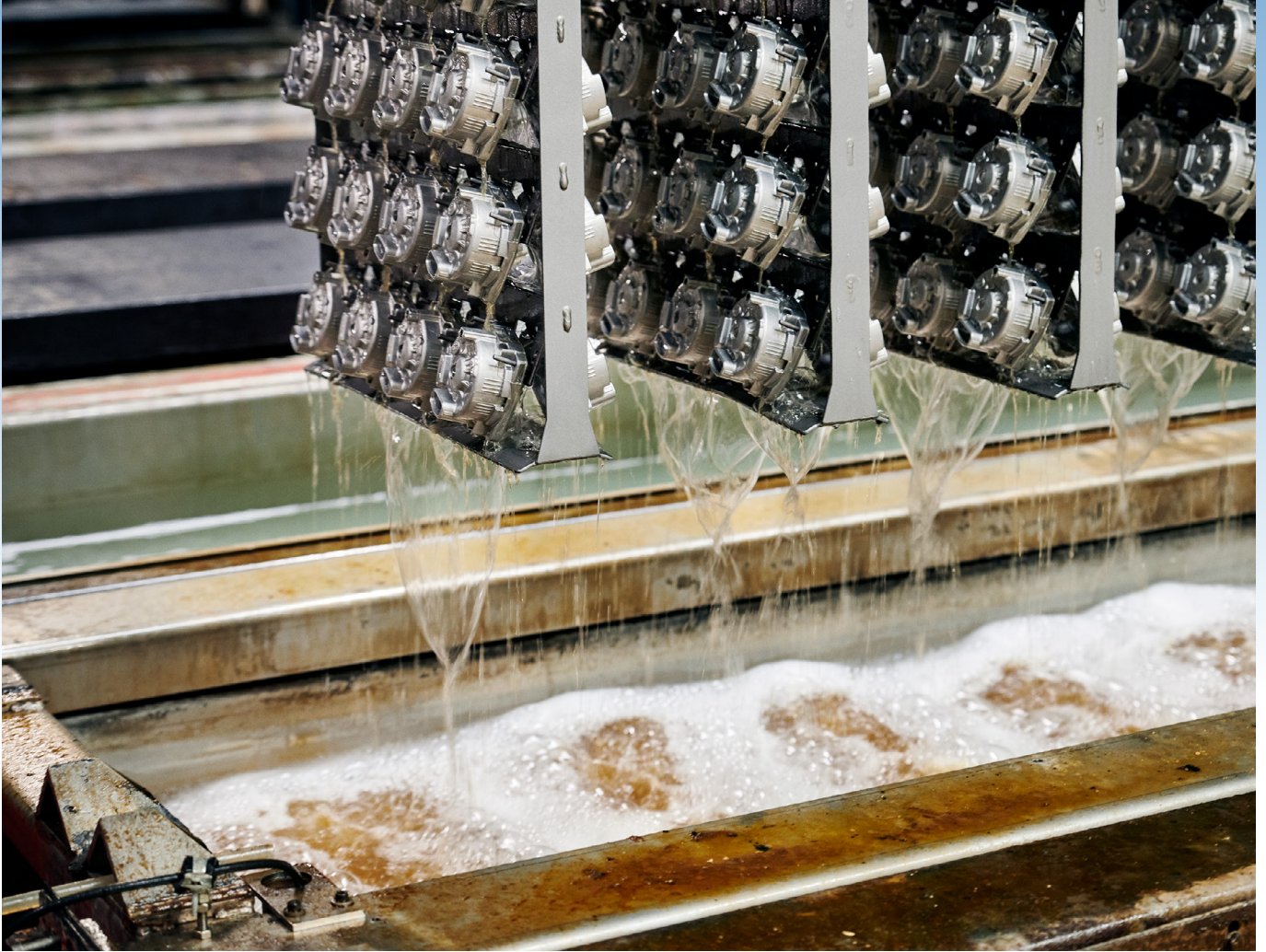
Racks of newly die-cast components rise from the first rinsing pool in the CED surface treatment system in the Grundfos factory in Bjerringbro.