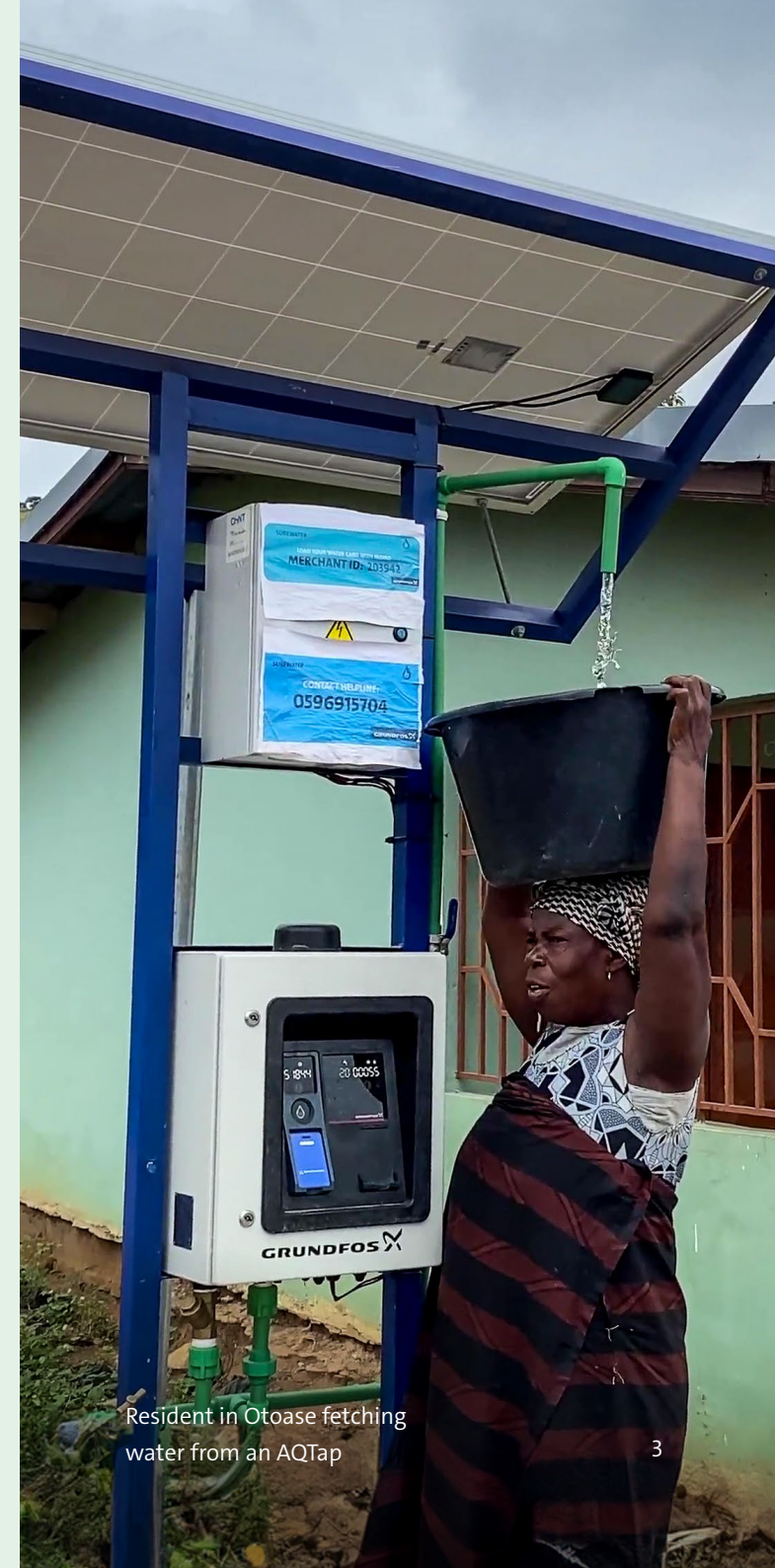
Resident in Otoase fetching water from an AQTap