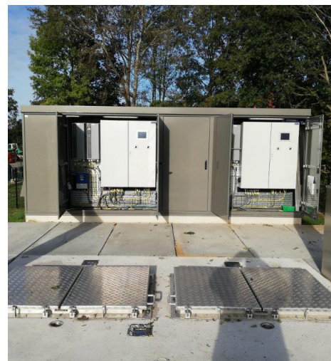
The pumps are operated by variable speed drives.